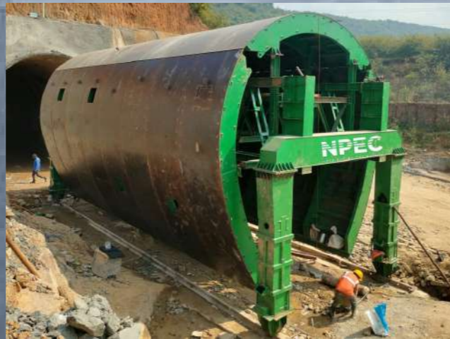
Tunnel Formwork Design and Fabrication Integrated with Hydraulic System