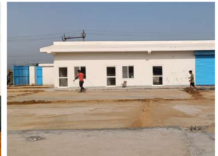
NFC-Jaipur (Upcoming) SHED AREA: 15,000 FT 2 ; OPEN AREA: 30,000 FT 2