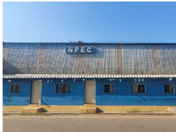
NPEC - Siliguri Industrial Estate SHED AREA: 5,000 FT 2 ; OPEN AREA: 6,000 FT 2