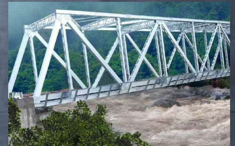
Steel Bridge Fabrication and Commissioning