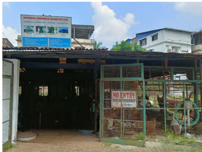
NCH - Church Road SHED AREA: 8,000 FT 2 ; OPEN AREA: 20,000 FT 2

National Power Engineering Company operates from five strategically located factories, each contributing to their formidable reputation in mechanical engineering and infrastructure development. The collective efforts of these units substantiate NPEC's widespread influence and highlight their ability to adapt, innovate, and meet diverse regional demands.