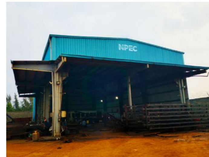
NPEC-Visakhapatnam SHED AREA: 10,000 FT 2 ; OPEN AREA: 90,000 FT 2