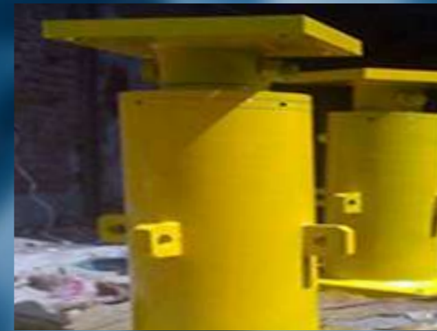
Hydraulic Jacks 100T/220T/500T