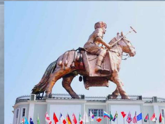
Iconic Steel Statues