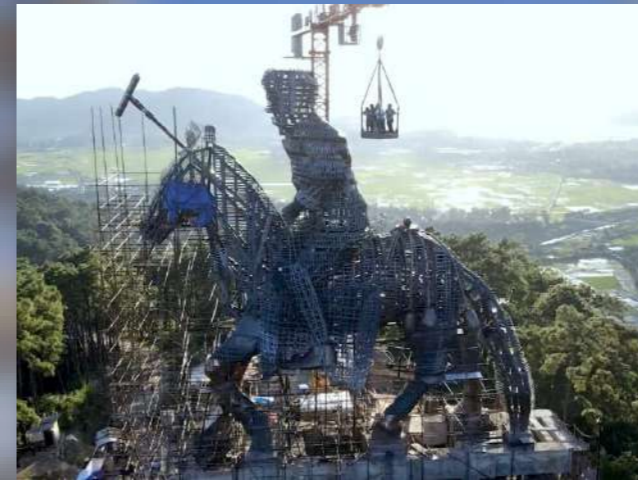
Steel Statue Commissioning