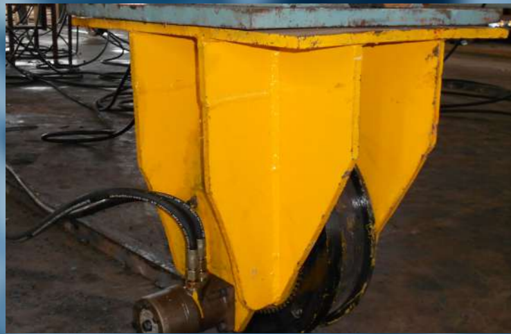
Hydraulic Operated Gantry Wheels

National Power Engineering Company offers in-house hydraulic solutions for tunnel and bridge formworks. We prioritize quality to ensure trouble-free operation, minimizing project downtime. Our experienced team designs custom hydraulic systems with a 50% load capacity safety factor, ensuring efficient and reliable performance.