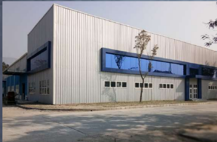
Pre-Engineered Building Custom Design Warehouses